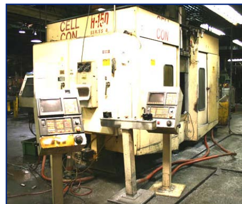
CELL-CON MODEL H-15D OPPOSED TWIN SPINDLE CNC HORIZONTAL MILL