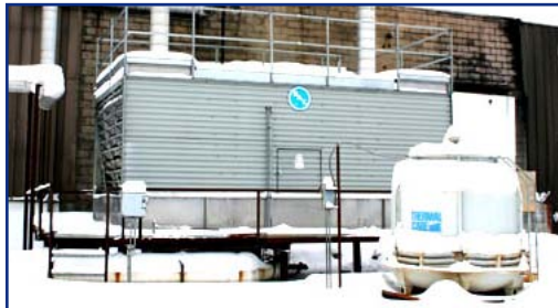
BALTIMORE AIR COIL MODEL 33458W PROCESS WATER COOLING TOWER