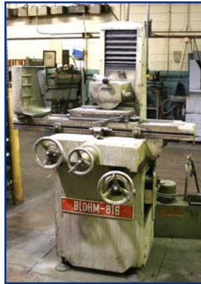
BLOHM 8-16 8" X 16" HAND FEED SURFACE GRINDER