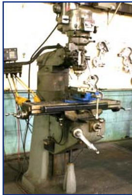
BRIDGEPORT SERIES I 2-HP VARIABLE SPEED VERTICAL MILLING MACHINE