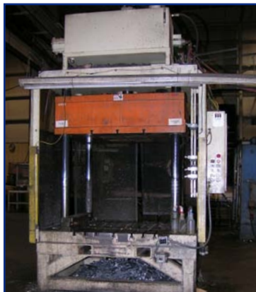
(1 OF 5) METAL MECHANICS TYPE, 50-TON 4-POST HYDRAULIC OPERATED TRIM PRESSES