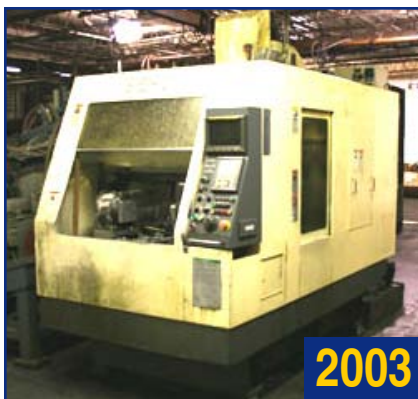
HOWA MSN-P500H-VCJ 4-AXIS HIGH-SPEED CNC VERTICAL DRILLING/TAPPING CENTER