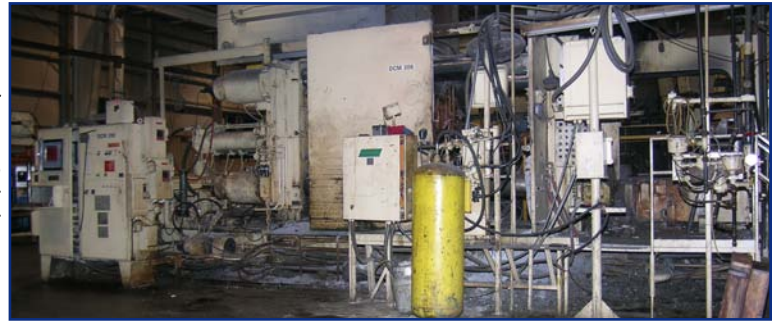
PRINCE MODEL 1651 1600-TON CAPACITY, COLD CHAMBER ALUMINUM DIE CASTING MACHINE