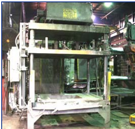
(1 OF 8) METAL MECHANICS 75-TON 4-POST VERTICAL TRIM PRESSES