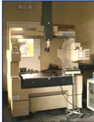
MITUTOYO FN-905 BRIDGE TYPE CNC COORDINATE MEASURING MACHINE