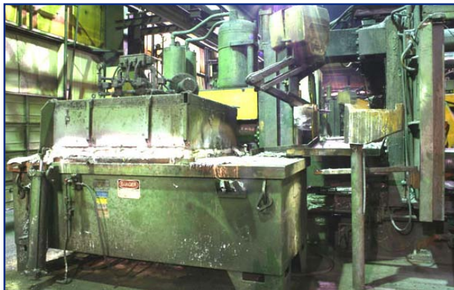
MPH GAS FIRED LOW ENERGY ALUMINUM HOLDING FURNACE