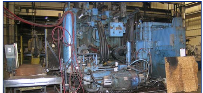
B & T 1600-TON CAPACITY, COLD CHAMBER ALUMINUM DIE CASTING MACHINE