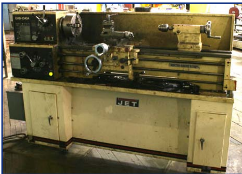
JET MODEL GHB-1340A 13" X 40" ENGINE LATHE