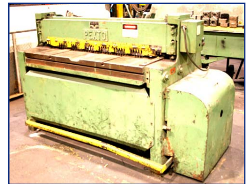
PEXTO MODEL 12-U-4J 12 GAUGE X 4' POWER SQUARING SHEAR