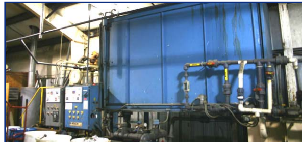
WASTE WATER TREATMENT SYSTEM