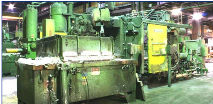
(1 OF 5) PRINCE MODEL 1246CCA 1200-TON CAPACITY, COLD CHAMBER ALUMINUM DIE CASTING MACHINE