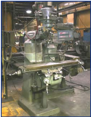
BRIDGEPORT SERIES I 2-HP VARIABLE SPEED VERTICAL MILLING MACHINE