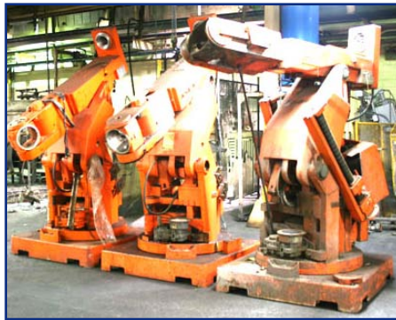
(3 OF 7) ABB & ASEA 6-AXIS ROBOTS