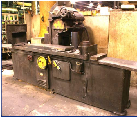
THOMPSON MODEL B 12" X 48" HYDRAULIC SURFACE GRINDER