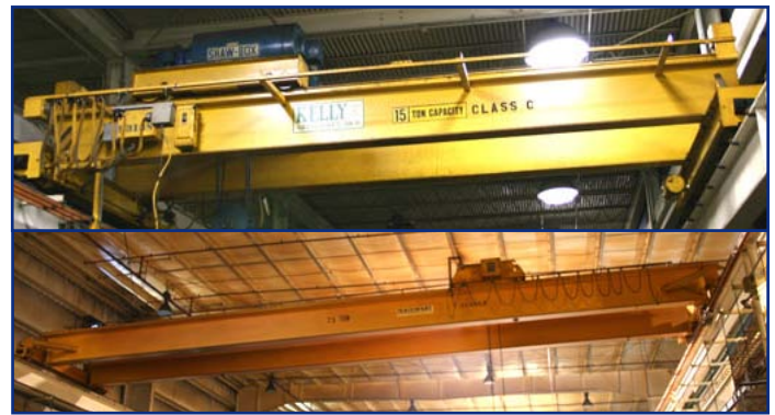
STEWART 25-TON X 60' SPAN & KELLY SALES 15-TON X 18' SPAN TOP RIDING DOUBLE GIRDER BRIDGE CRANES