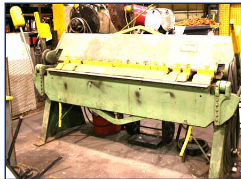
DREIS & KRUMP CHICAGO MODEL BP-614-6 6' X 14 GAUGE FINGER TYPE HAND BENDING BRAKE