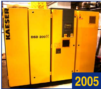
2005 KAESER "SIGMA PROFILE" DSD-200 200-HP ROTARY SCREW AIR COMPRESSOR