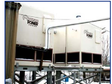
ADVANTAGE PT-270-ES 270-TON PROCESS WATER COOLING TOWERS