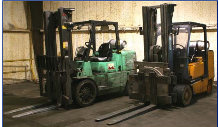
MITSUBISHI MODEL FGC60K 13,500-LB. & YALE MODEL SLC120M3N0A8100, 12,000-LB. CAPACITY FORKLIFTS