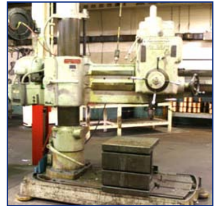
CINCINNATI-GILBERT 4' ARM X 11" COLUMN RADIAL DRILL