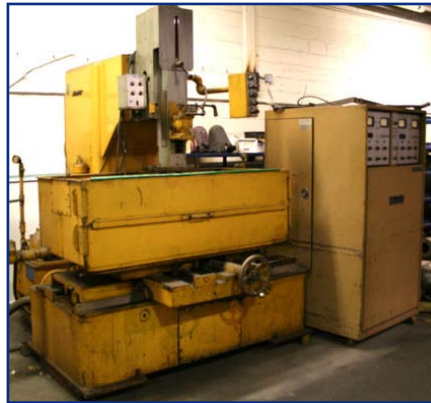
ELOX MODEL HRP-109 RAM TYPE EDM