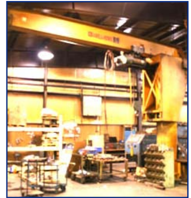
ABELL HOWE 7-1/2-TON 360 DEGREE FREE-STANDING JIB CRANE