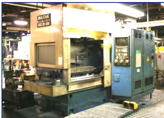
MAZAK MODEL VQC-20/40B CNC VERTICAL MACHINING CENTER