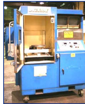
LAKE X-RAY INC. "PORTABLE QUALITY ASSURANCE" 160 KV INSPECTION MACHINE