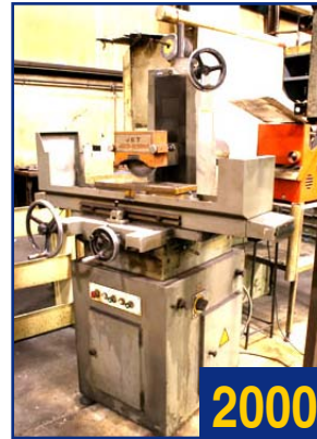
JET JSG-618M 6" X 18" HAND FEED SURFACE GRINDER