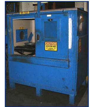
LAKE X-RAY INC. LKX2004-2L 50 KV INSPECTION MACHINE