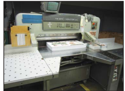
POLAR MOHR 114EMC MON, 45" SHEAR