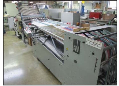
STAHL BRO-30 FOLDER WITH RIGHT ANGLES & FEEDERS