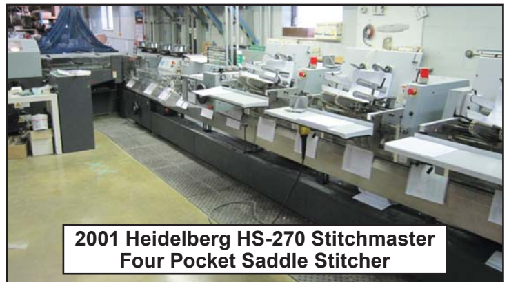
2001 Heidelberg HS-270 Stitchmaster Four Pocket Saddle Stitcher

AUCTION DATE: Wednesday, March 24 th • 10:30 AM