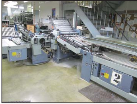
STAHL VSA3/86M FOLDER WITH RIGHT ANGLES