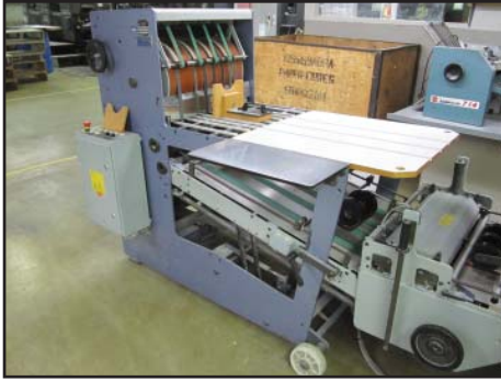
1 OF 2 STAHL VSA IN-LINE STACKERS