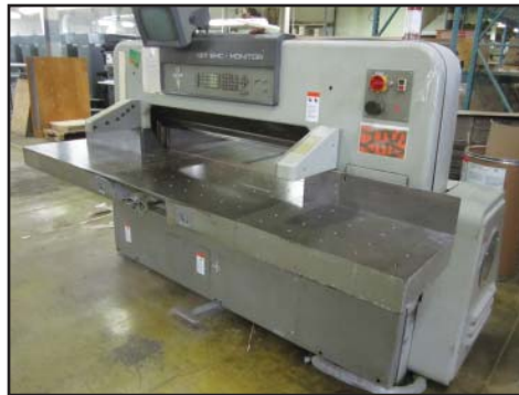
POLAR MOHR 137EMC-MON 54" SHEAR