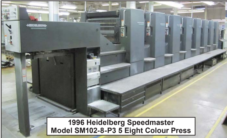
1996 Heidelberg Speedmaster Model SM102-8-P3 5 Eight Colour Press