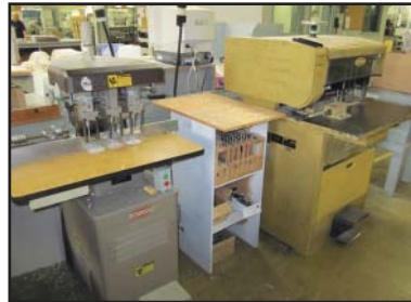
(2) CHALLENGE FIVE/THREE HEAD DRILLS