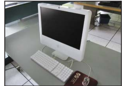
1 OF 8 MAC COMPUTERS