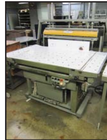
POLAR MOHR AIR TRANSFER TABLE