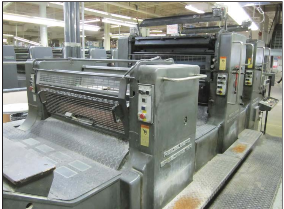
HEIDELBERG SPEEDMASTER 102ZPL TWO COLOUR PRESS