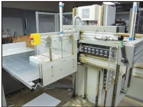
POLAR MOHR TRL30EP TRANSFORMAT LIFTING TRANSFER