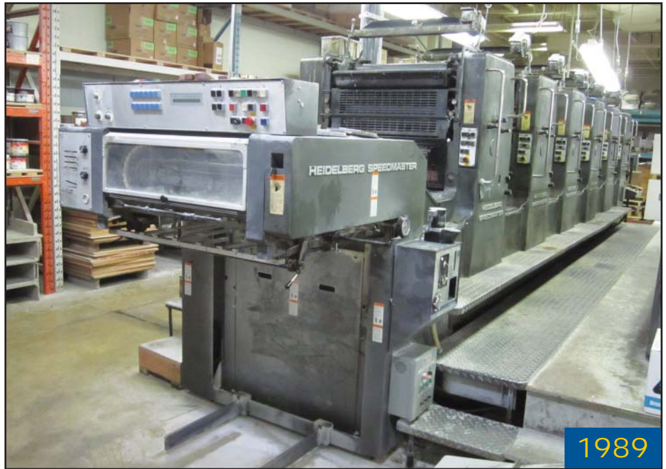
HEIDELBERG SPEEDMASTER 72SPP SIX COLOUR PRESS