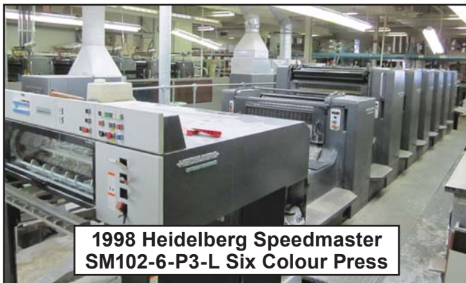
1998 Heidelberg Speedmaster SM102-6-P3-L Six Colour Press